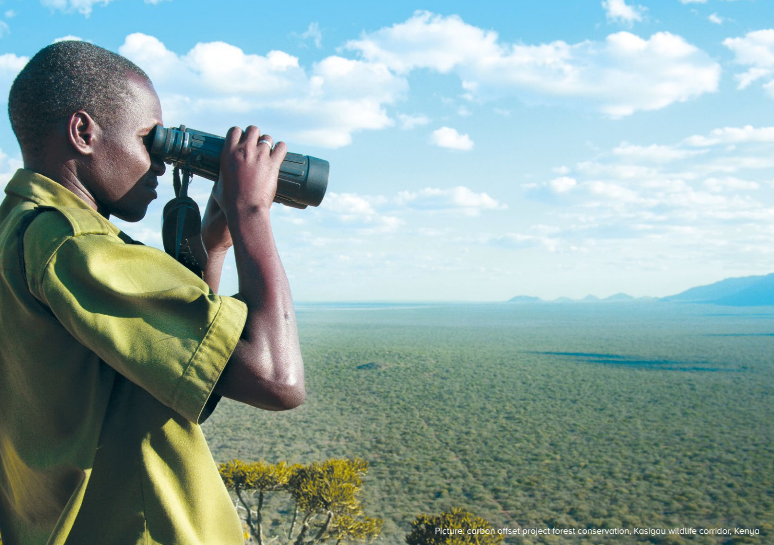
Picture: carbon offset project forest conservation, Kasigau wildlife corridor, Kenya