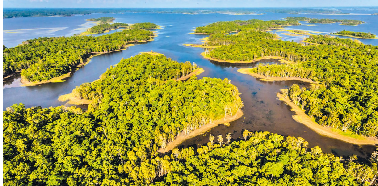
Picture: carbon offset project forest conservation, April Salumei, Papua New Guinea

Emissions savings in April Salumei: 1.03 million tons per year.