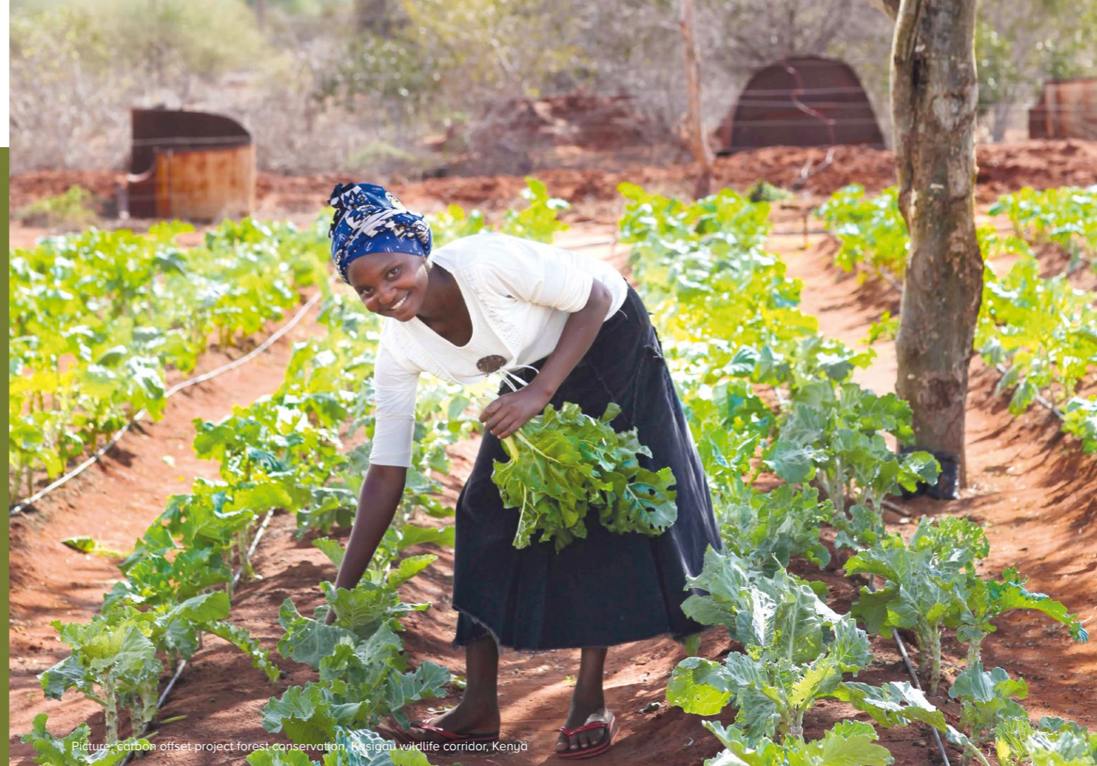
Picture: carbon offset project forest conservation, Kisumu wildlife corridor, Kenya